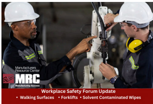
Workplace Safety Forum Update ▪ Walking Surfaces ▪ Forklifts ▪ Solvent Contaminated Wipes

The discussion centered on: Walking-Working Surfaces: Understanding OSHA's guidelines for safe walking surfaces, including ladders, floors, and stairways. From inspections to proper maintenance, we covered strategies to prevent slip, trip, and fall hazards in the workplace.