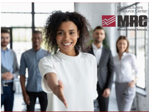
MRC HR Forum Update All Things Drug Testing and Marijuana-Related Impacting the Workplace

With PA being one of the most challenging and litigious states for marijuana-related workplace concerns, Strategic and practical guidance was shared on navigating this evolving landscape.